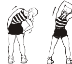
11. Lateral Flexion Stretch (one side, then the other, push pelvis across as you bend)